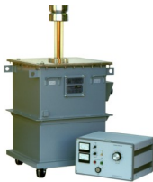
KV100-100 100kV 100mA

High voltage test systems are also available from T&R Test Equipment up to 100kV 100mA.